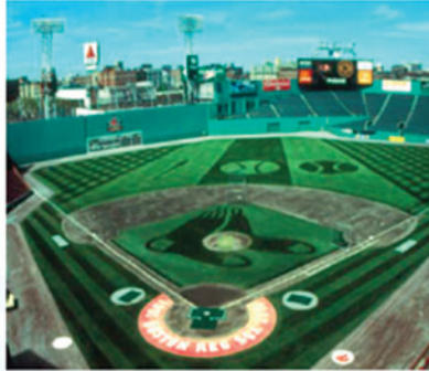
Meaningful Use of Grass

“There is a whole new ‘alphabet soup’ of language and acronyms to learn. We need to become proficient at our messaging – our ‘elevator speeches’ should become about quality, safety, and cost. However, as we learn and use the new language and frameworks, we should not forget the old language. It is essential that we stay true to the roots and values of what brought us here.”